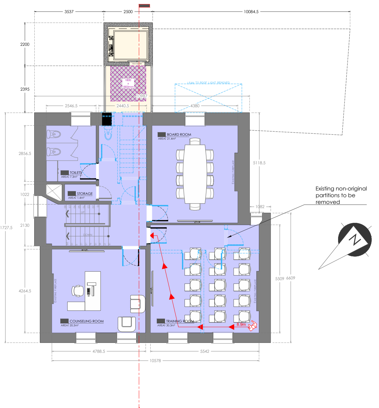
SECOND FLOOR PROPOSAL SCALE 1:100